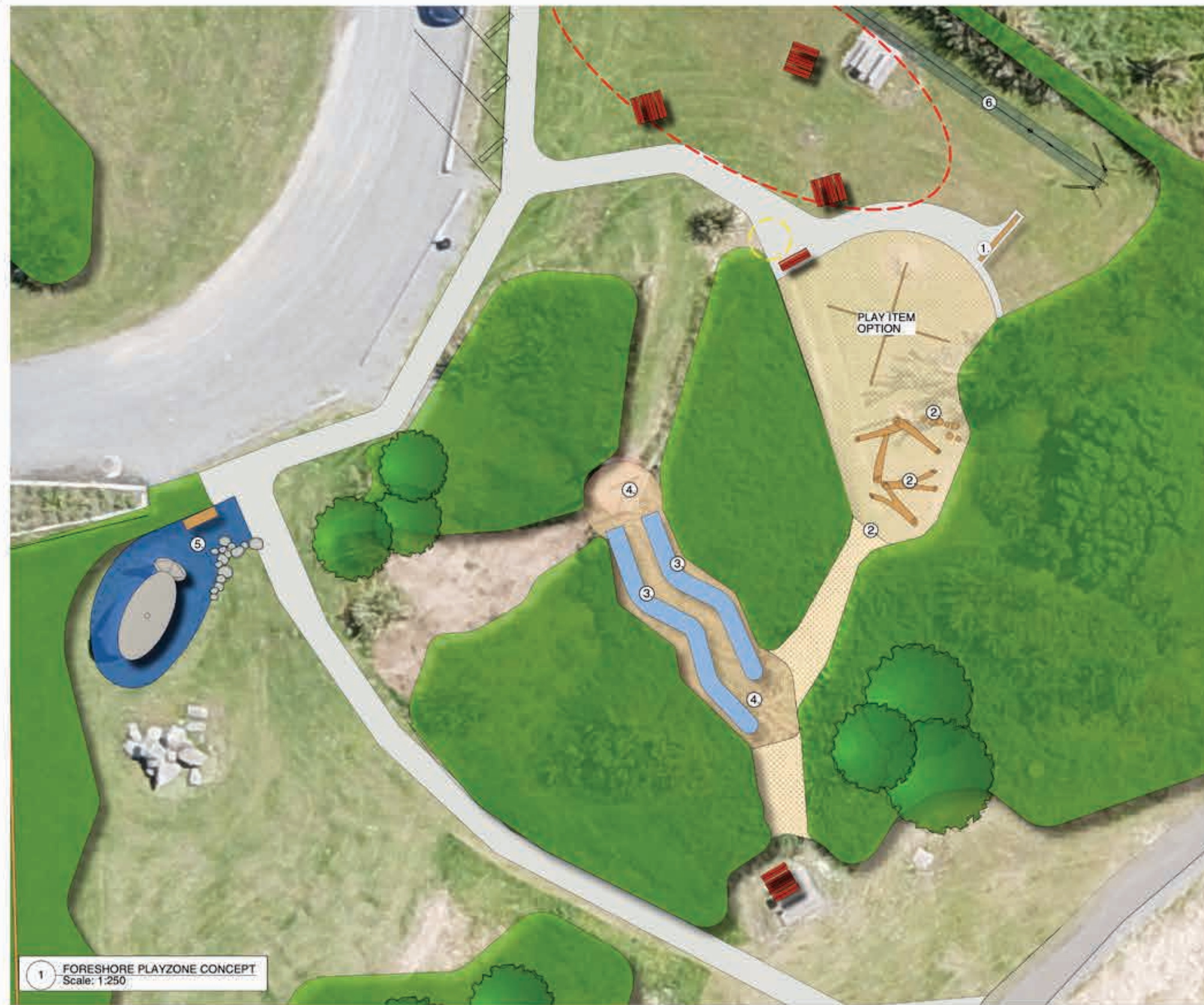
1 FORESHORE PLAYZONE CONCEPT Scale: 1:250

This is your chance to contribute and work alongside Council to determine the best outcome for this unique play space. Share your ideas here.